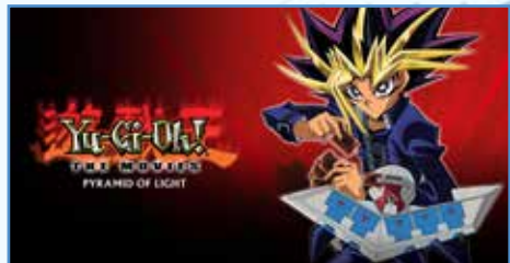
Yu-Gi-Oh: The Movie - July 7