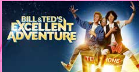
Bill & Ted's Excellent Adventure July 31