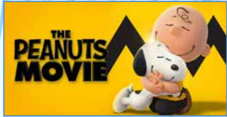
The Peanuts Movie - June 23