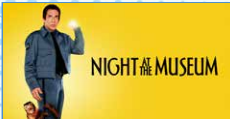
Night at the Museum - June 30