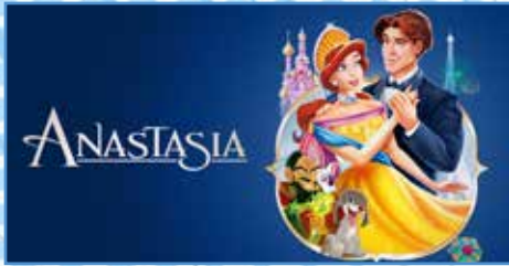
Anastasia - June 9

Family Movies on Tuesdays @ 10am & 2pm | All Shows $3