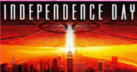
Independence Day July 3