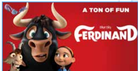
Ferdinand - July 21