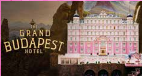
The Grand Budapest Hotel June 12