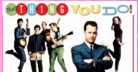
That Thing You Do! June 26