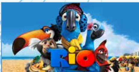
Rio - July 28