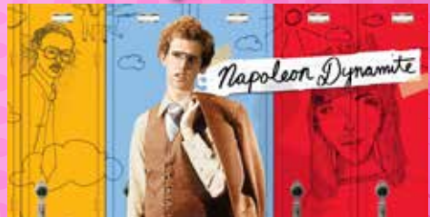
Napoleon Dynamite July 17