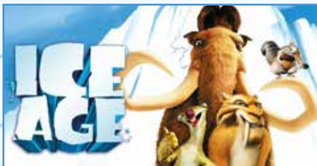
Ice Age - July 14